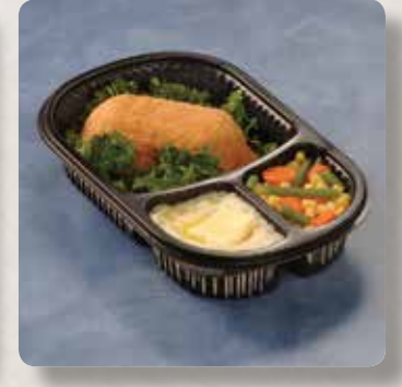
Clean & sanitary. Seals a wide variety of trays including platters.