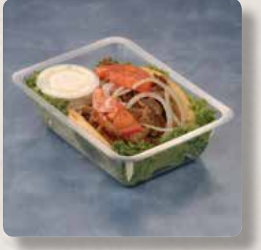
Longer shelf life.