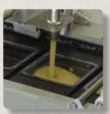
Optional tray filler.