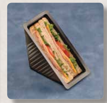
Professional, appetizing food presentation.