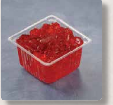
Airtight seal, retains freshness, water tight and leak proof.