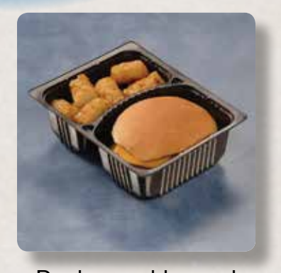
Dual ovenable meal trays available, seals between compartments.